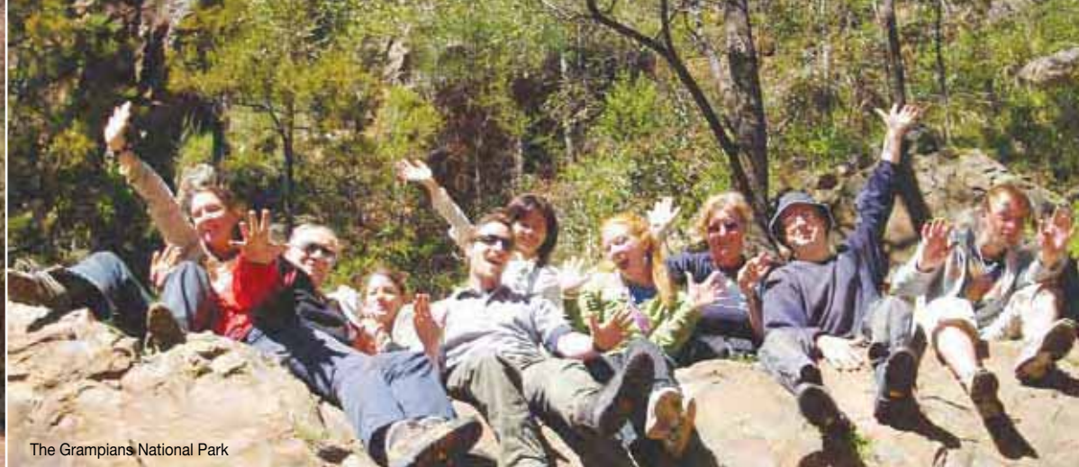
The Grampians National Park